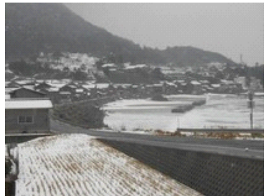
Landscape in Ukawa