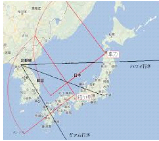
Range of the X-band radar