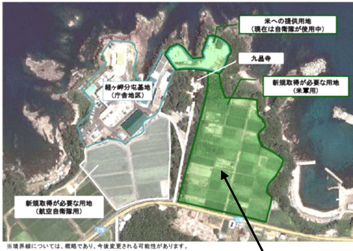
Planned construction site of the new US base